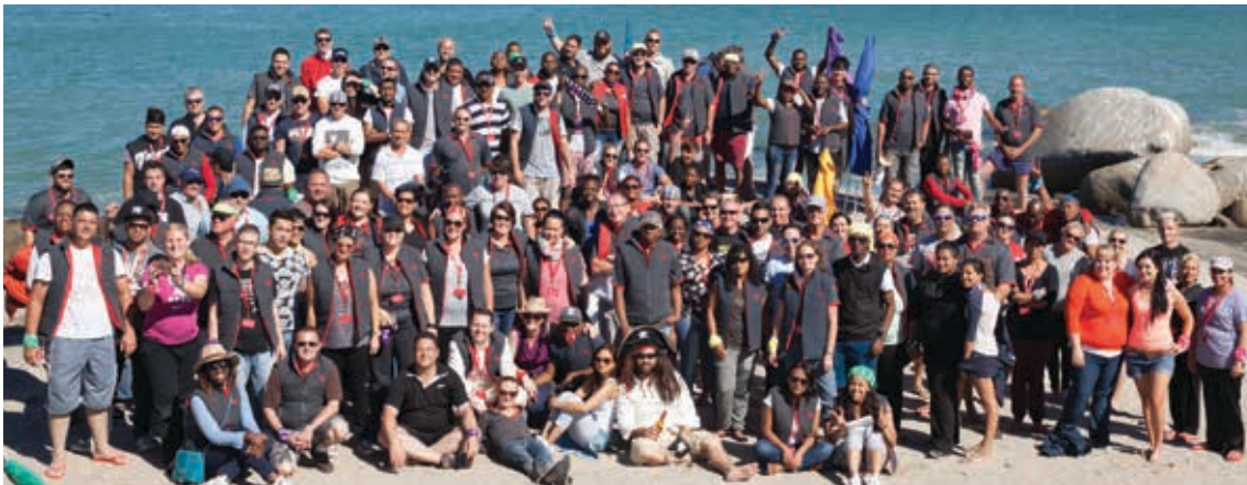
Stor-Age Staff Conference 2016